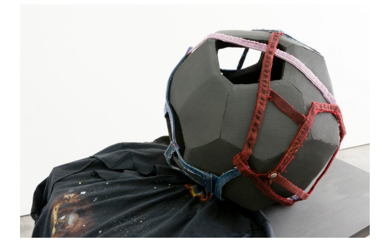
Insomnia (detail view), 2013, stoneware, neoprene, flocking, t-shirt, and wood.Orb: 12 3/4 x 11 1/2 x 12 1/4 inPedestal: 28 3/8 x 16 1/4 x 33 1/2 in

Guillen, Bianca, "Anna Sew Hoy's 'Home Office' at Various Small Fires, Los Angeles," San Francisco Arts Quarterly, May 14, 2013, page 3 of 3.